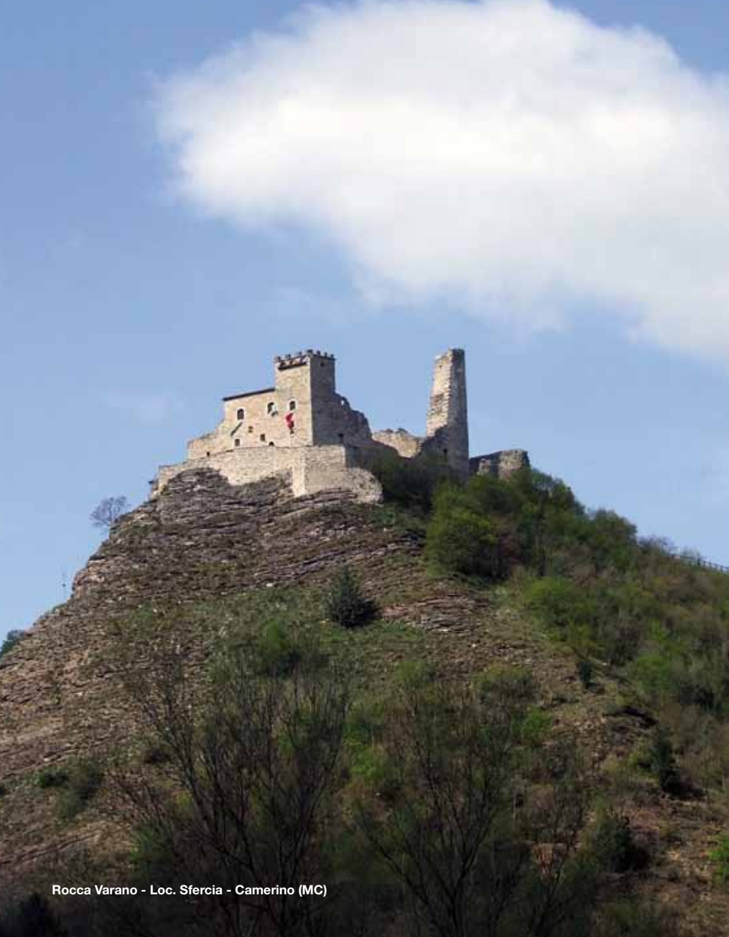
Rocca Varano - Loc. Sfercia - Camerino (MC)