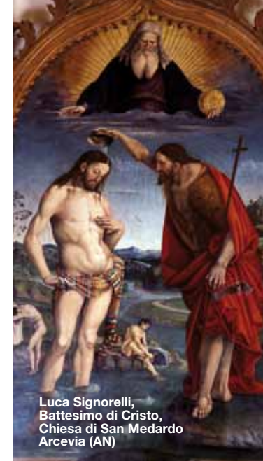
Luca Signorelli, Battesimo di Cristo, Chiesa di San Medardo Arcevia (AN)