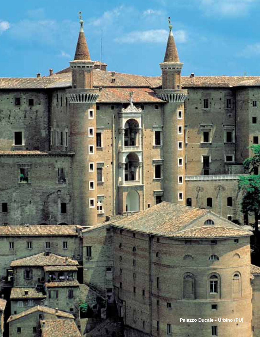
Palazzo Ducale - Urbino (PU)