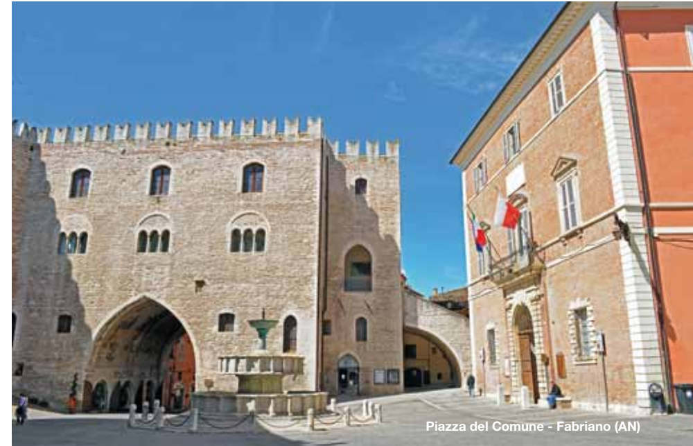
Piazza del Comune - Fabriano (AN)

The Rovere Fortress and the Ducal Palace in Senigallia are examples of military architecture in the Province of Ancona. The imposing Fortress of Offagna was the seat of the battles