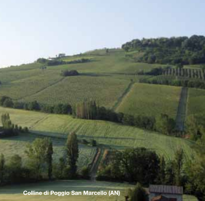
Colline di Poggio San Marcello (AN)