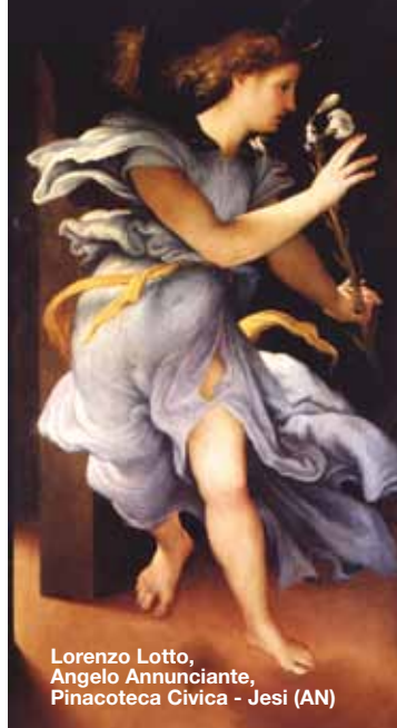
Lorenzo Lotto, Angelo Annunciante, Pinacoteca Civica - Jesi (AN)