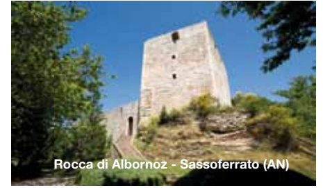
Rocca di Albornoz - Sassoferrato (AN)

Montefeltro family and the Pope, are the architects designing the main defensive buildings. The Malatesta family was the earliest family that started to choose the new style of defence fortifications in the territory which, today, covers the Province of Pesaro Urbino. They designed the Fortress of Fano with the help of the famous expert architect Filippo Brunelleschi and the experienced Matteo Nuti. They were followed by the Sforza family in Gradara (formerly a Malatesta fortress) and Pesaro (the Fortress of Costanza, by Luciano Laurana). The Montefeltro family, in turn, led by the genius of Francesco di Giorgio Martini for defensive buildings ( Fortress of Sassocorvaro , Fortress of Montecerignone , Fortress of Fossombrone , the Fortress and Tower of Cagli , Fortress of Frontone ) as well as civil buildings ( Ducal Palace of Urbino and Urbania ). The Fortress of Mondavio and the Ducal Palace