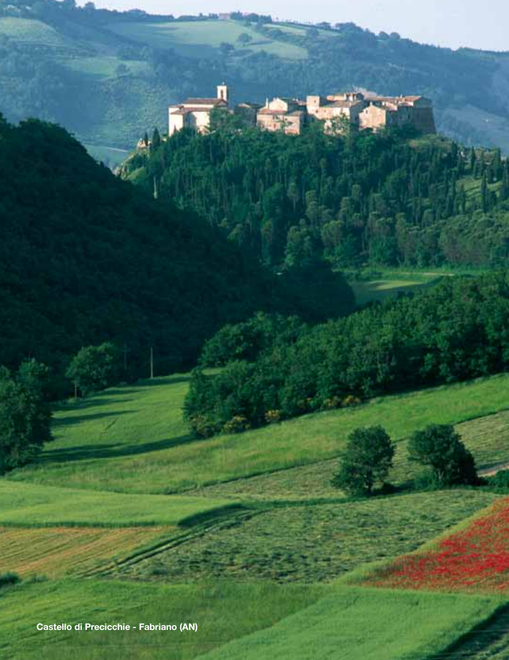
Castello di Precicchie - Fabriano (AN)

Montefeltro family and the Pope, are the architects designing the main defensive buildings. The Malatesta family was the earliest family that started to choose the new style of defence fortifications in the territory which, today, covers the Province of Pesaro Urbino. They designed the Fortress of Fano with the help of the famous expert architect Filippo Brunelleschi and the experienced Matteo Nuti. They were followed by the Sforza family in Gradara (formerly a Malatesta fortress) and Pesaro (the Fortress of Costanza, by Luciano Laurana). The Montefeltro family, in turn, led by the genius of Francesco di Giorgio Martini for defensive buildings ( Fortress of Sassocorvaro , Fortress of Montecerignone , Fortress of Fossombrone , the Fortress and Tower of Cagli , Fortress of Frontone ) as well as civil buildings ( Ducal Palace of Urbino and Urbania ). The Fortress of Mondavio and the Ducal Palace