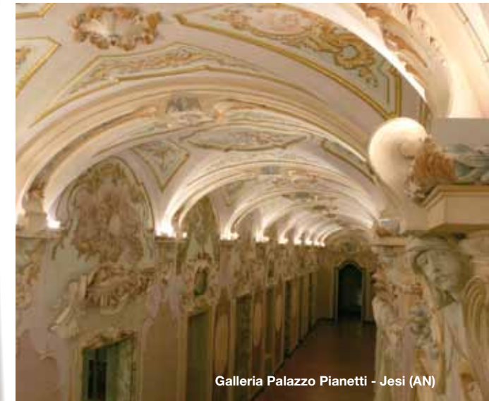
Galleria Palazzo Pianetti - Jesi (AN)

Palazzo Pianetti (XVIII century) is located in Via XV Settembre and houses the municipal Art Gallery, which contains masterpieces by Lorenzo Lotto as well as the magnificent gallery with rococo