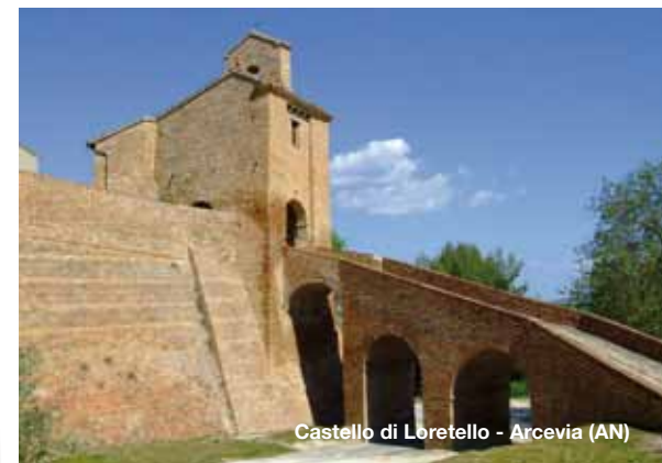
Castello di Loretello - Arcevia (AN)

Arcevia is located on a hill with the evocative name of Monte Cischiano, the lowlands of the pre-Apennine chain on the Umbria-Marche Region slopes. Its thirteenth-sixteenth century town walls retaining a number of towers and four gates, are mighty and easily accessible. The most interesting buildings of the old town are: the baroque collegiate church of St. Medardo, which contains masterpieces by Luca Signorelli, works by Della Robbia, Gian Battista Salvi and Claudio Ridolfi; the Misa theatre, an architectural gem built between 1840 and 1845 inside the Palazzo dei Priori and the Church of St. Agatha; the cultural centre of San Francesco, housed within the former Franciscan convent where the Renaissance cloister and the magnificent church are located. The State Archaeological Museum of Arcevia has an important collection of archaeological finds from the territory of Arcevia. There are splendid funerary remains in the Gallic necropolis of Montefortino (forth-third century BC). The nine castles of Arcevia (Avacelli, Castiglioni, Caudino, Loretello, Montale, Nidastore, Palazzo, Pitticchio, San Pietro) are among the main attractions: these are walled towns based on a fourteenth-fifteenth century plan, which have preserved their typological traits right up to the present day.