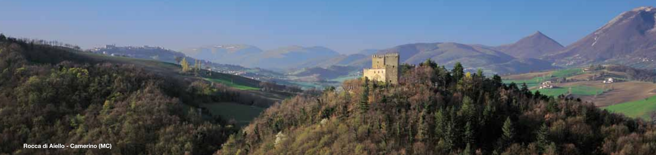
Rocca di Aiello - Camerino (MC)

culture of the poems of chivalry. The Ducal Palace of Camerino is among the notable buildings of civil architecture built by the Da Varano family, and is now home to the University. It has an original section, which was rebuilt in the late fourteenth century. It was extended and completed in the mid-to-late fifteenth century in the Renaissance style. The whole building is centred around a wonderful square-porticoed courtyard accessed by several rooms, including the Sala degli Sposi ("hall of the newly-weds") with fifteenth century frescoes.