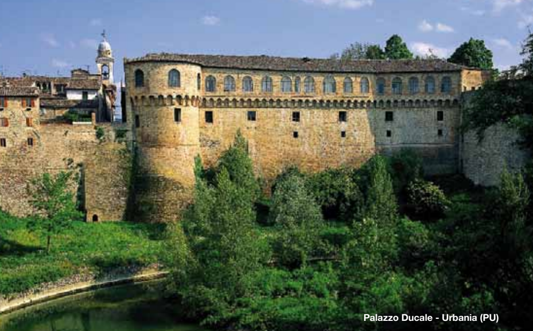
Palazzo Ducale - Urbania (PU)

or ravelin fortification structure. The Fortress Montecerignone preserves its ancient medieval structure, alongside the typically Renaissance elements introduced by Martini. The Ubalduesca Fortress of Sassocorvaro , still fully intact, combines robust military construction with the typical features of the aristocratic residence. At Sassocorvaro , Martini refined the prototype of the circular fortress, whose main function was to deflect the stone balls shot from the bombard cannon. In Frontone there is also a fortress designed by Martini, whose shape resembles a ship's prow. The Fortress Mondavio is a remarkable stronghold, with its keep on polygonal foundations, and the typical series of trap doors and battlements. During the Della Rovere family's lordship, the Marche Region enjoyed a flourishing period. The Fortress of Gradara , created as a