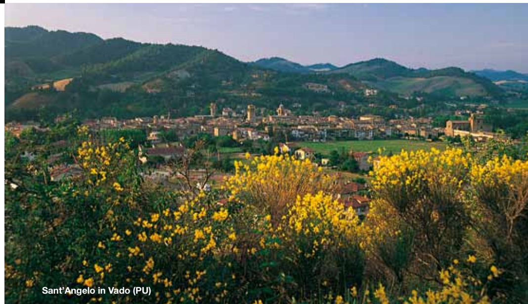
Sant'Angelo in Vado (PU)