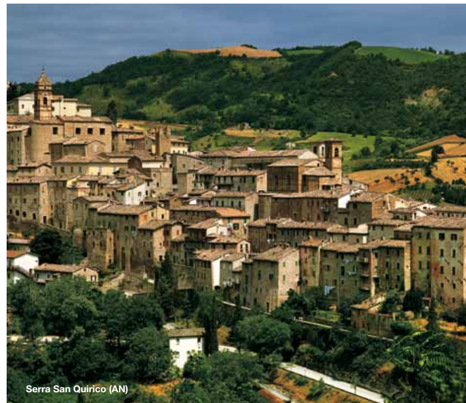
Serra San Quirico (AN)

Verdicchio Wine is one of the most famous, traditional DOC wines of the Marche Region. The Verdicchio Castelli di Jesi Riserva carries the DOCG label. Among the best-known red wines is the DOC Lacrima di Morro D'Alba, produced in the area of Morro d'Alba. Palazzo Balleani, in the historic centre of Jesi, houses a section of the Enoteca Regionale or regional Wine Bar, which is an important centre of promotion of quality wines and the typical local produce of the Marche region. Italcook has its headquarters in the same building: this Italian cuisine school started thanks to cooperation between the commune of Jesi and Slow Food Italy.