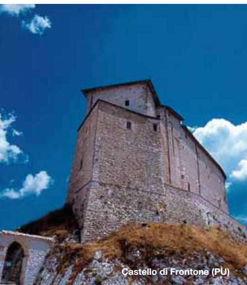
Castello di Frontone (PU)

military stronghold on bordering lands from the twelfth century, was transformed into a noble residence by the powerful families that succeeded one another in ruling the territory, including the Della Rovere. Lucrezia Borgia and Francesca da Rimini stayed at the castle. This was probably the location of the tragic love story between Paolo and Francesca, told by Dante Alighieri in his Divine Comedy. The Sforza Castle of Pesaro , known as Villa Imperiale, was transformed in 1530 at the behest of the Della Rovere family, and the Palazzo Nuovo ("New Palace") was added, renowned for its beautiful interiors filled with frescoes. Senigallia boasts its fifteenth century Fortress Roveresca , a model military fortification typical of lowland strongholds. It was built in 1450 by Giovanni della Rovere, who became lord of Senigallia in 1474.