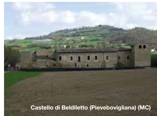
Castello di Beldiletto (Pievebovigliana) (MC)