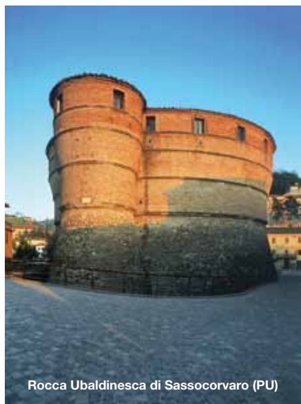
Rocca Ubalduesca di Sassocorvaro (PU)