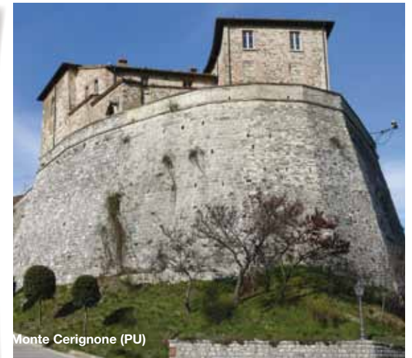
Monte Cerignone (PU)

Urbino: Festival of the kite 1st Sunday of September www.festaquilone.it