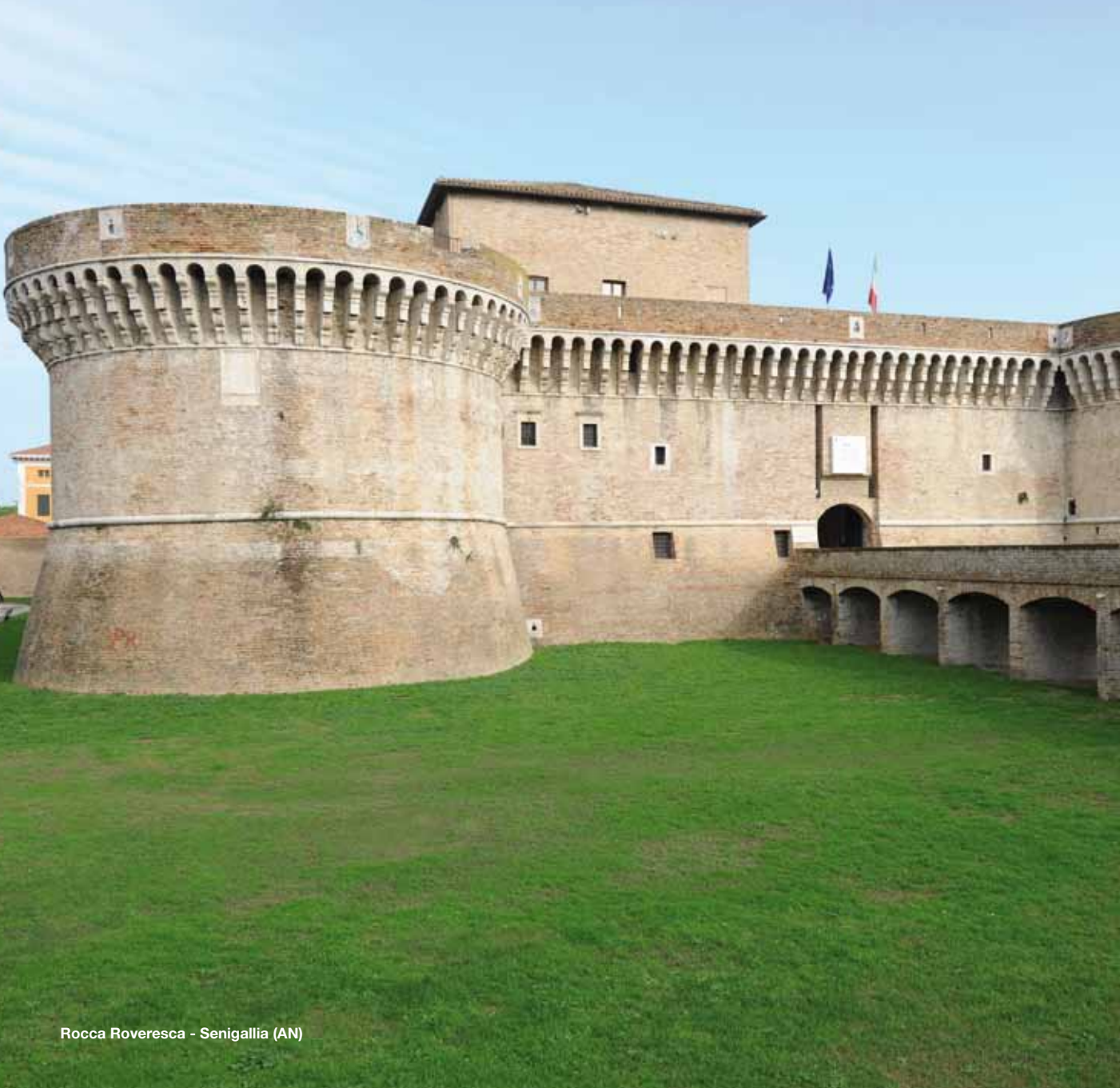
Rocca Roveresca - Senigallia (AN)

thus encouraging the development of the independent communes which led, between 1300 and 1400, to the creation of states and autonomous areas ruled by families, unrelentingly struggling with one another. These historical events explain why there are so many fortresses and castles in the region, witnessing a cultural past when the best and most renowned military architects of the time worked and made several experimentation. You can go on a fascinating itinerary all over the region, visiting the military structures distributed throughout the area, built to protect the towns and the territory.