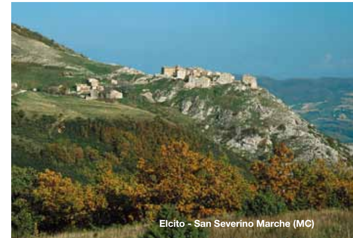
Elcito - San Severino Marche (MC)

The Marche Region - the word comes from "Mark" which means a border in German - was far from the centre of imperial power,