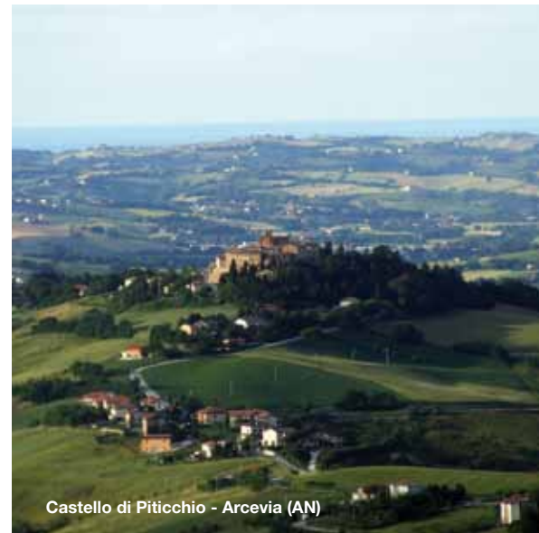
Castello di Piticchio - Arcevia (AN)