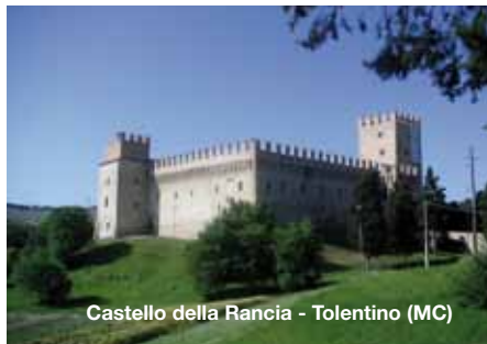
Castello della Rancia - Tolentino (MC)

between Ancona and the neighbouring Osimo. The Priora Fortress in Falconara is worth a visit, with its beautiful doorway by Vanvitelli and the castle in the upper section.