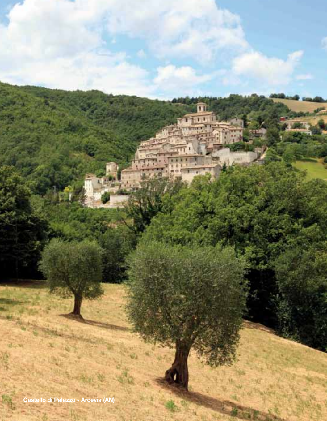
Castello di Palazzo - Arcevia (AN)